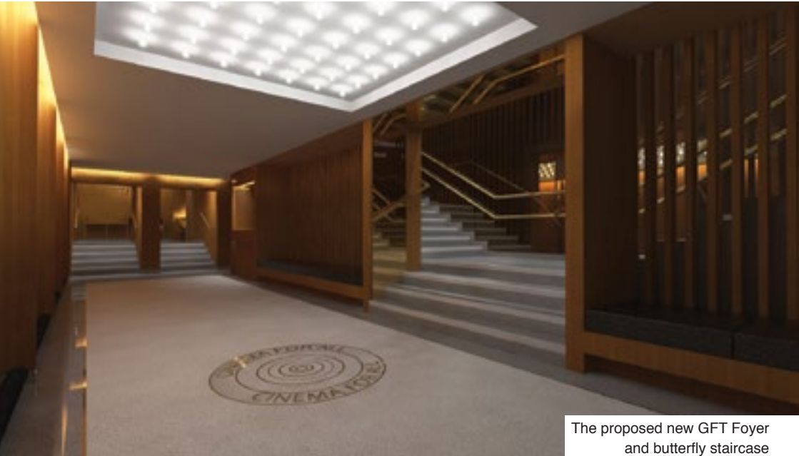
The proposed new GFT Foyer and butterfly staircase

It's the audience that brings the buzz, atmosphere and energy to any arts organisation, and we're determined to make sure that GFT is open to as many people as possible.